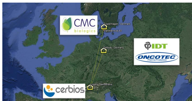
Our partners have different supply chain options from the Alliance partners all located in Europe